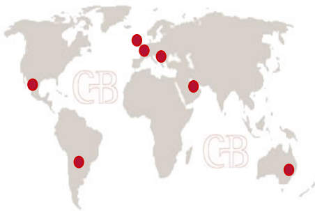
Worldwide Centres of Excellence.